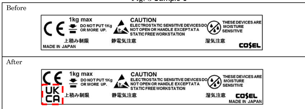
Fig. 3 Sample 3

BRFS, BRDS, BRNS, CBS, CDS, CES, CHS, CQHS, CQS, DBS, DHS, DPF, DPG, MG, MH, SFCS, SFLS, SFS, SUS, SUW, SUCS, SUCW, SUTS, SUTW, TUNS, TUHS, TUXS, VAF, SNDBS, SNDHS, SNDPF, SNDPG, SNTU, STMG