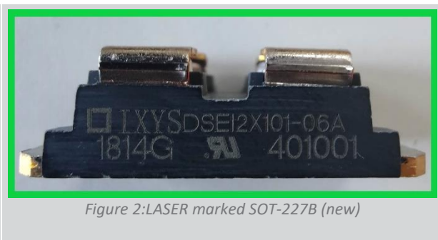
Figure 2: LASER marked SOT-227B (new)

A description of the marking is given in Figure 3