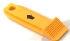
Lock Ejector 2-2069253-1 (Printing black ink)