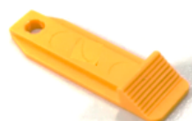
Lock Ejector 3-2069253-1 (No Printing ink)