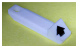
Lock Ejector 1-2069253-2 (No Printing ink)