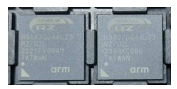
(B) PKG bottom view

<OS site B (additional site)> <OS site A (current MP site)>