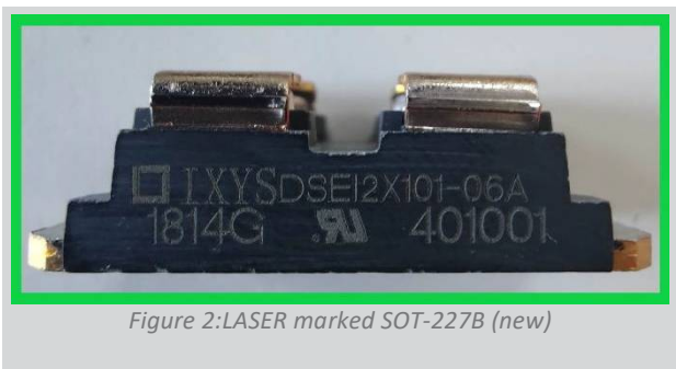
Figure 2: LASER marked SOT-227B (new)

A description of the marking is given in Figure 3